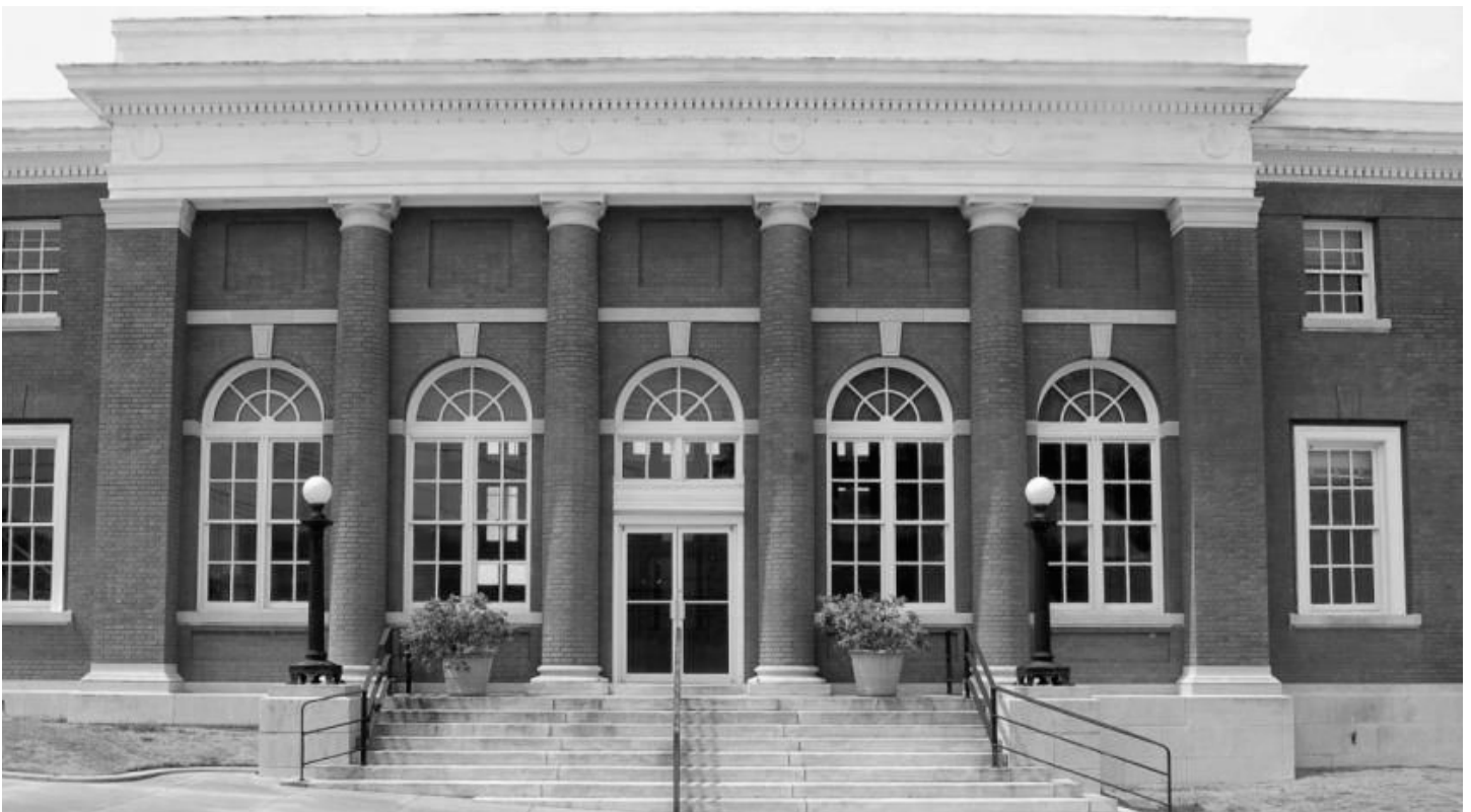
Troy-Pike Cultural Arts Center converted Troy's former post office into a community arts facility.

Requests for design work related to a specific facility or an arts space will be considered for support. Proposed work in this phase must produce a tangible design in the form of blueprints, renderings, schematics or other documents necessary for construction, renovation, installation or adaptive reuse of the facility or space in question. Qualified and certified architects and design professionals must be involved in and selected as part of the application process. A design document will be expected at the end of the grant period (details adequate for construction bids or construction management by certified professionals). Submission of design work will be required before final grant funds are released. Grants in this area will generally not exceed $50,000. All grants must be matched dollar-for-dollar in cash and in-kind services.