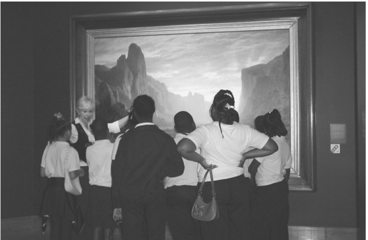
Discussion at the Birmingham Museum of Art regarding the painting by American artist, Albert Bierstadt, entitled Looking Down Yosemite Valley, California. Oil on Canvas, 1865.